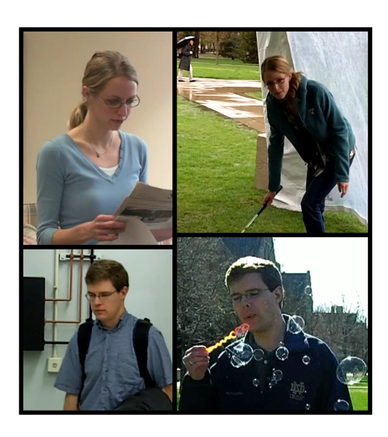
Fig. 1. Clips of two people sampled from four PaSC handheld videos: files 06599d91.mp4, 06599d451.mp4, 05450d1359.mp4 and 05450d1759.mp4.

covariates are reported for each participant. The covariates include properties of the faces such as size, the locations and sensors used to acquire videos, and properties of the subjects such as gender and race. The dominate factor influencing performance is the combination of locations, actions and sensors, indicating verification rates more than double when going from the most to the least challenging environments.